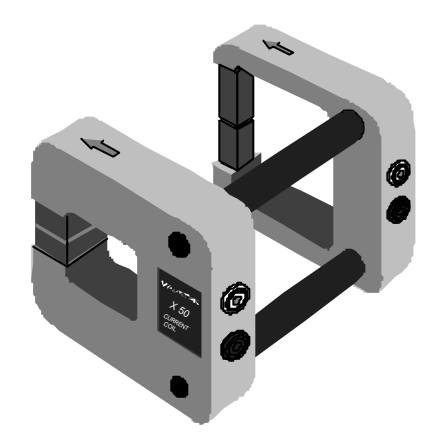
Figure 1. Ten turn and fifty turn coil assembly.

The effect of conductor positioning and sensitivity to interfering fields are factors which influence achievement of correct results for both usage and calibration of clampmeters. Some clamp devices have alignment markers on the jaws to assist users in positioning the current carrying conductor in the optimum position. When using current coils the users must pay regard to such features of individual clamp devices and to correct alignment with the coils. The correct position is to maintain the coil windings centrally within the jaws with the plane of the jaw perpendicular to the coil windings and the body of the clamp device in line with the body of the coil. Even though the design of the current coils described substantially reduce the dependency on positioning for the majority of clamp devices, it is important for optimum alignment to be used for highest accuracy and repeatability. Figure 2 depicts correct alignment.