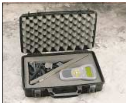
The Model 9318 Hard Carrying Case protects your Handheld Thermometer, a probe, and all your accessories.

See our calibration and data acquisition software packages on page 78.