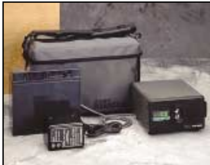
Model 9102 shown with battery pack, which includes a battery, carrying bag, cables, and charger.