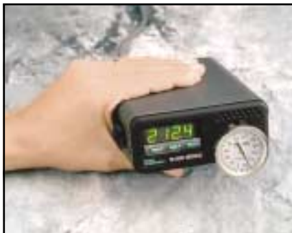
Take the 9100 anywhere. It's the smallest dry-well in the world.

device to the display temperature or to an external reference, and the difference is the error in your device. The 9100 HDRC has a display resolution of 0.1 degrees, an accuracy of \pm 0.5^{\circ}\text{C} between 35 and 200^{\circ}\text{C} and \pm 1^{\circ}\text{C} between 200 and 300^{\circ}\text{C} , a stability of \pm 0.3^{\circ}\text{C} , and a stabilization time of five minutes.