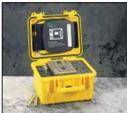
The 9009 is built into a small, lightweight, rugged enclosure that holds everything you need and comes in black or yellow.