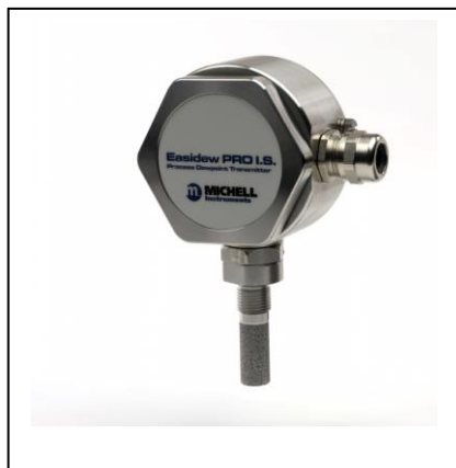
Easidew PRO I.S.