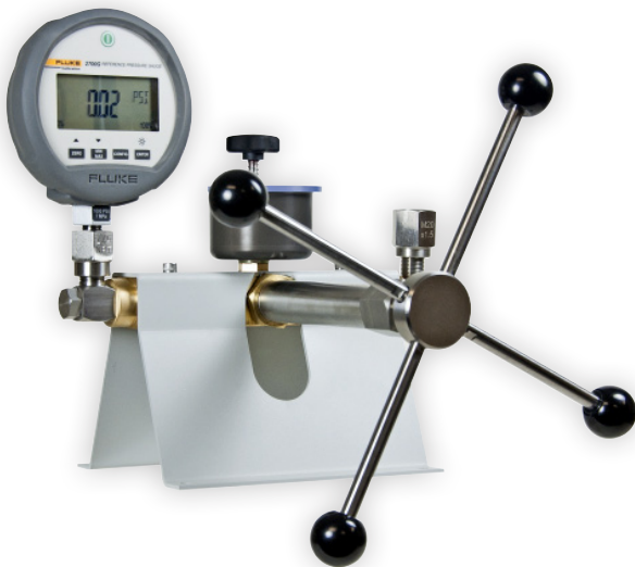
Combine the 2700G gauge with the P5510, P5513, P5514 (shown here) or P5515 Comparison Test Pumps for a complete bench top pressure calibration solution.

The 2700G Reference Pressure Gauges provide best-in-class measurement performance in a rugged, easy-to-use, economical package. Improved measurement accuracy allows it to be used for a wide variety of applications. It is ideal for calibrating pressure measurement devices such as pressure gauges, transmitters, transducers, and switches. In addition, it can be used as a check standard or to provide process measurements with data logging.