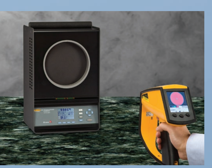
Calibrate it right the first time with a traceable, uniform, correctly-sized target.

Business decisions costing thousands of dollars are based on the results of your measurements, so they had better be right! It can be very expensive to shut down a line for repairs and maintenance, but it might be catastrophic if the shutdown is unplanned. To stand by your measurements with confidence, you should definitely have your thermometers calibrated.