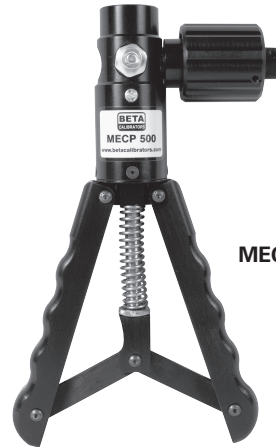
MECP-500 Hand Pump