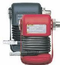
The Fluke pressure module can be placed here during transport

The space in the mold has been designed to fit one of the three Fluke process calibrators shown above. The tight fit ensures a stable setting and yet easy removal. The electric cable to connect the pressure module is 100 cm long, allowing the module in use to be positioned wherever most convenient for the operator.