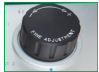
The MNR 90 precision volume adjuster allows very fine pressure control up to within 100 Pa