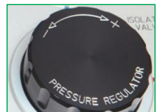
The MNR 180 pressure regulator is designed specifically for use in calibration and test applications

The space in the mold has been designed to fit one of the three Fluke process calibrators shown above. The tight fit ensures a stable setting and yet easy removal. The electric cable to connect the pressure module is 100 cm long, allowing the module in use to be positioned wherever most convenient for the operator.