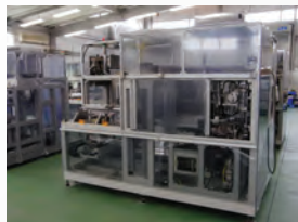
OCA attaching equipment