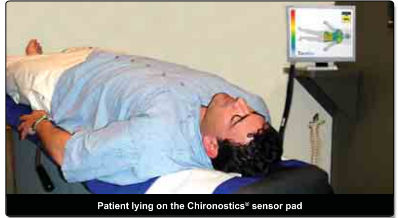
Patient lying on the Chironostics® sensor pad