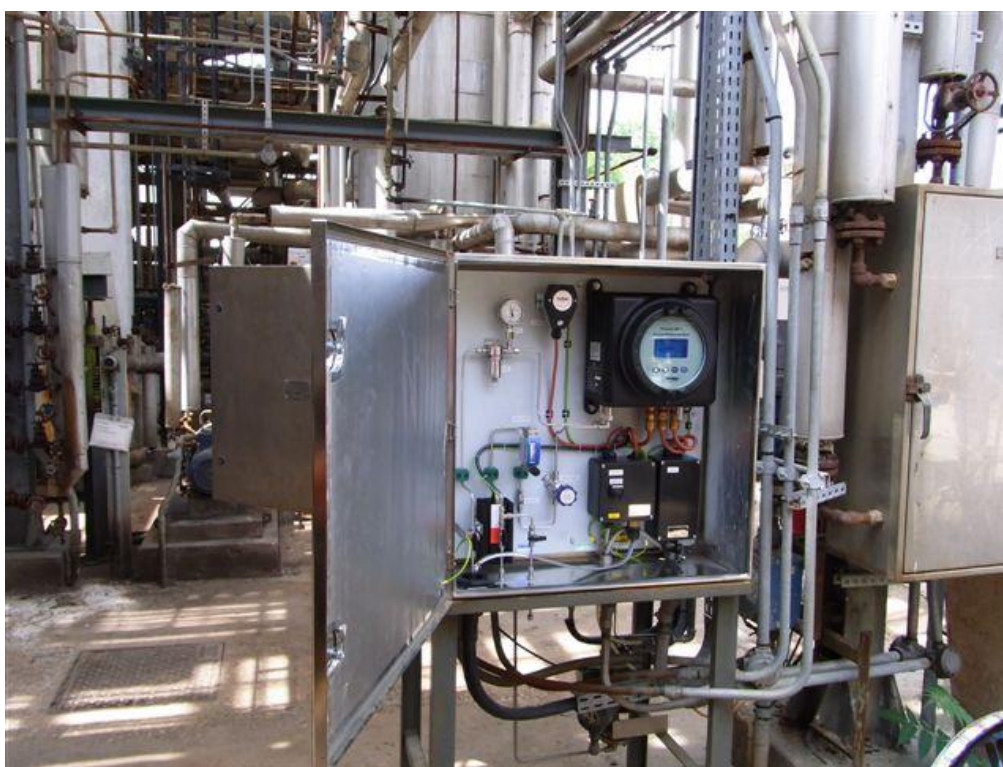
Typical installation of Promet EExd in UOP Platforming process

Design capacities of Platformer units vary from 1000 - 4500 tons/day. Operating pressures vary from 3.5 barg up to 30 barg. CCR's operate in the lower pressure range, increasing yield of liquid reformat, as cracking reactions are reduced, but the lower partial pressure of hydrogen increases rate of coke formation, hence only CCR units operate at lower pressures.