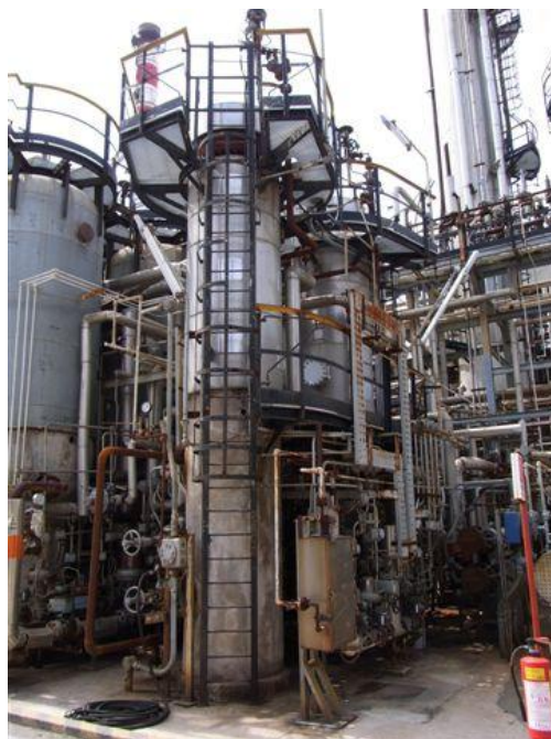
Molecular sieve dehydration columns

To maximise the interval between catalyst regeneration, operators continuously monitor moisture in the hydrogen gas re-cycle to maintain 15 to 25 ppmV within the comingled naptha/hydrogen feed within the Platforming process. To assure the correct feed condition, less than 1 ppmV moisture content is required in the H 2 re-cycle, typically 0.1ppmV, processed by molecular sieve desiccant in a twin column configuration. Periodic regeneration of the bed is required, achieved by back flushing with liquid benzene at 300°C. Process plant operators activate drier bed regeneration when the actual measured moisture content reaches greater than 1 ppmV, so yielding cost and efficiency benefits over a fixed time based interval.