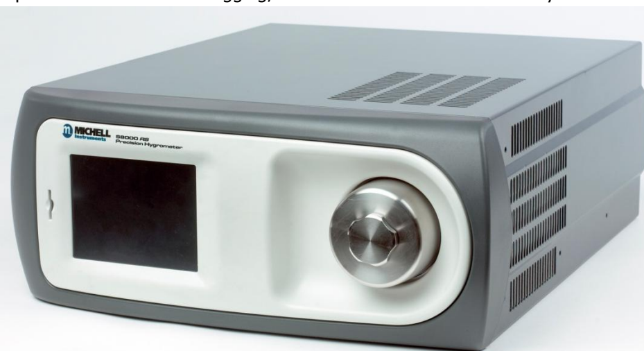
Michell Instruments S8000RS Chilled Mirror Hygrometer

extremely low measurement uncertainties (for more details on specific calibration uncertainties please contact Michell instruments).