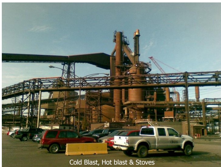
Cold Blast, Hot blast & Stoves

These hot gases exit the top of the blast furnace and proceed through gas cleaning equipment where particulate matter is removed from the gas and the gas is cooled. This gas has a considerable energy value so it is burned as a fuel in the "hot blast stoves" which are used to preheat the air entering the blast furnace to become "hot blast". Any of the gas not burned in the stoves is sent to the boiler house and is used to generate steam which turns a turbo blower that generates the compressed air known as "cold blast" that comes to the stoves.