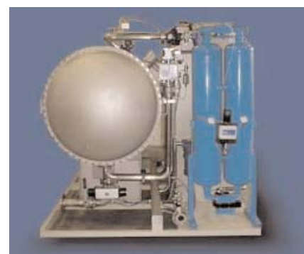
Typical Industrial Ozone Generation System

If a high moisture level exists in the feed gas, arcing of the electrodes and in extreme cases contact breakover to chamber walls, will occur. This arcing will damage the electrodes and the system walls and eventually lead to failure and expensive repair.