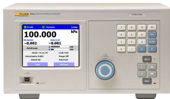
PPC4 Pressure Controller/Calibrator with advanced user interface